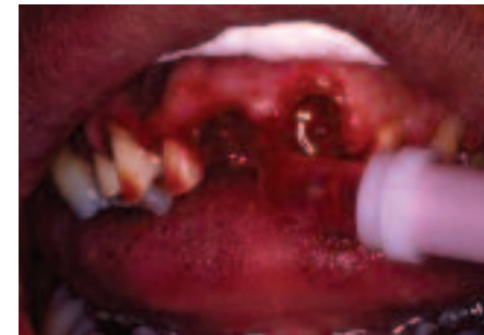
Figure 4—The wetting of Biopiant material.