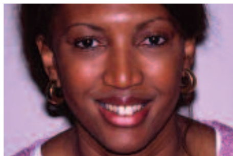
Figure 1—A preoperative full-face image.

Biopiant synthetic material has been reported effective for after dental applications such as ridge preservation after extraction, ridge augmentation, periodontal defects, apical lesions, cysts, granulomas, sinus lifts, and placement of immediate postextraction or delayed implants. 6,9,10