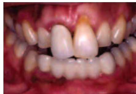
Figure 3—A preoperative retracted view.