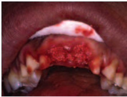
Figure 5 —The placement of Biopiant synthetic bone.