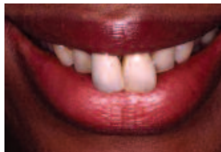
Figure 2—A preoperative smile.