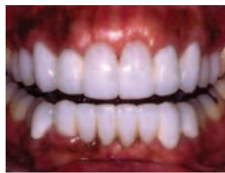
Figure 7 —A postoperative retracted view.