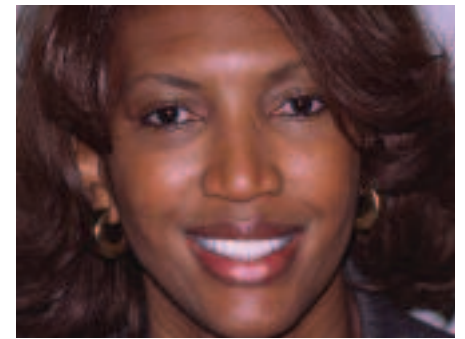
Figure 8 —A postoperative full-face image.